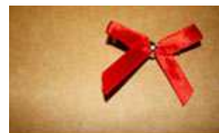
Gifts that give back