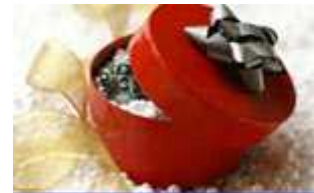
Gifts for women