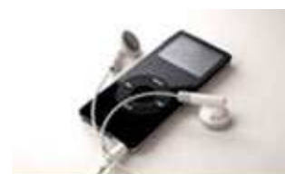
Gifts for High School Kids