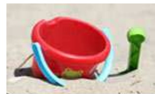
Gifts for babies and toddlers