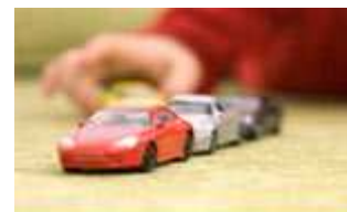
Gifts for Primary School Kids