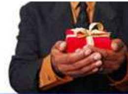
Gifts for men

The MySchool MyVillage MyPlanet Team 0860 100 445